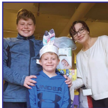
Birthday Party benefits the Pantry

The Baby and Children's Pantry began as an offer of support to the women who were involved in the maternity program but over the years has become a valuable tool for many area families who need a bit of extra help. Managed largely by volunteers under staff direction and stocked primarily with donations,