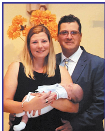
New mom and dad welcome a son

One hundred and thirty years since the Center's inception, Maternity and Family Services, Saint Joseph's original program, remains as vital today as ever it was. Extending assistance to expectant mothers and to new mothers with babies who find themselves without a safe place to live, to infants awaiting adoption and couples hoping to offer a home to a child, to children of all ages who are in need of a permanent family and to young families who love each other but may struggle financially, these are the people who remain the focus of this very active department. Encompassing multiple programs, Maternity and Family Services encourages life affirming choices and aids children and adults as they work towards building a happy and healthy future together.