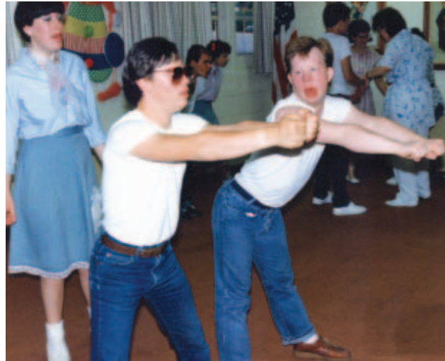
In 1977, St. Joseph's sponsored a rural program that sent a nurse practitioner on the road to do screenings for at risk children in local communities.

In recognition of the evolution of programs and emphasis on extending services beyond 2010 Adams Avenue, the name St. Joseph's Children's and Maternity Hospital was changed in 1979 to St. Joseph's Center.